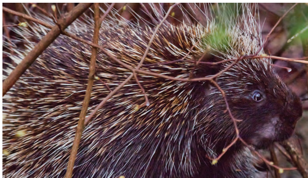
“Porcupine Quills” by Phil Bellfy