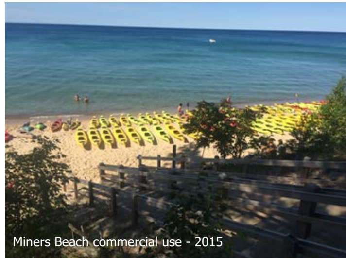
Miners Beach commercial use - 2015

conditions of those permits, enacted 2 years prior by the park, were loose with little to no mechanisms to require the businesses to change behaviors and/or lessen numbers. More importantly, the businesses had good safety records and the question had to be asked, "why limit a service that the public obviously wants, executed by a good partner?" So the issue became and remains: how much combined boating use, both commercially guided and privately initiated- is appropriate for this beach, its resources and facilities? With that asked, the park instituted a moratorium on new land based kayak businesses, until such time as carrying capacity could be determined.