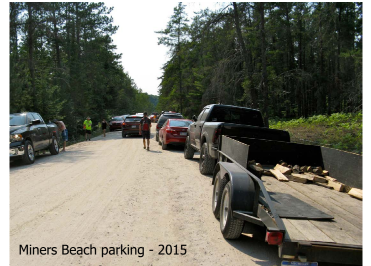
Miners Beach parking - 2015

Once basic information is understood, the park will develop alternatives for use for Miners Beach in a two year planning process beginning October 2017. Sum-