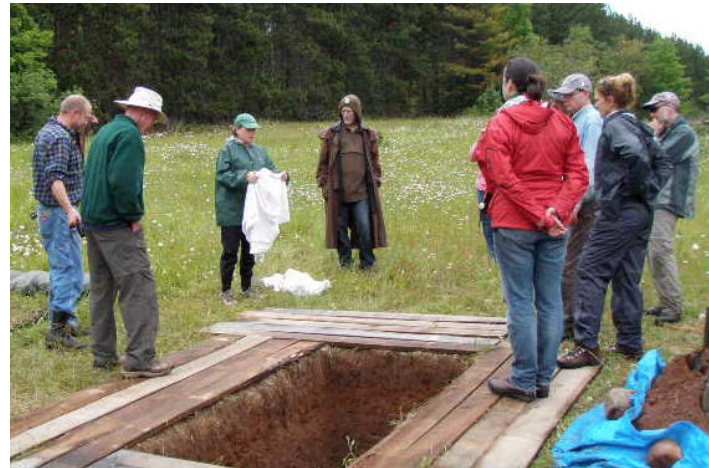
KGBA members participate in a "green burial practicum" during the summer of 2015, where they learned about home funerals, green burial practices, and promotional strategies.

To learn more about green burial and burial planning, the Portage and Chassell Township cemeteries, and the activities of the KGBA, they welcome you to visit their website at www.kgba.weebly.com and/or to find (and like) them on Facebook. The KGBA is also willing to share their experience and insights with people throughout the U.P. who are interested in creating green burial choices within their own communities.