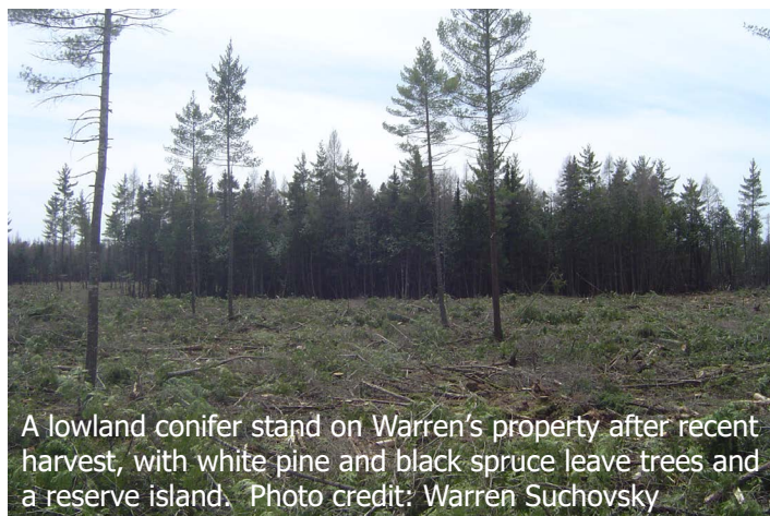
A lowland conifer stand on Warren's property after recent harvest, with white pine and black spruce trees and a reserve island.

Matt and his family own a 20-acre camp next to the Laughing Whitefish River near Deerton, MI. Their property includes a 12-acre stand of northern hardwoods that Matt intends to manage for sugarbush and wildlife habitat. When Matt considered climate change risks that might be most important for his woods, a few big things came to mind. Climate change has the potential to cause