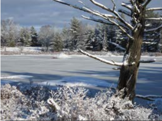
Beaver pond - Kingston Plains

UPEC made a promise early in 2016 to publish an Environmental Scorecard specific to both UPEC's achievements, as well as publishing an overall State of the U.P. It illustrates the overall environmental progress achieved in our region relative to the loss or gain of quality protected lands, the viability of wildways, the vitality of our top predators, the control of invasive species, the status of biodiversity and the adaptation to climate change.