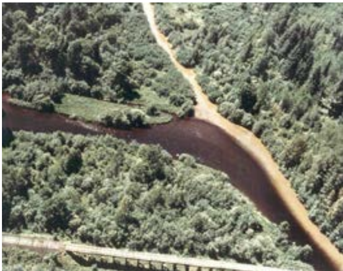
Mining also had a significant detrimental effect on UP trout streams where ore deposits were found. This is an air photo of the confluence of the Iron (polluted) and Brule Rivers (clear). The trout stream degrading pollution was caused by large outfalls of acid mine water into the Iron River near the town of Iron River. (early 1970's DNR photo).

less aggressive subsequent to the initial cutover in the early 1900's. Relatively speaking, many of the trout stream watersheds in the Ottawa NF have reasonably recovered. and much of the softwood (conifer) logging needed to be transported by rail because those wood species would not adequately float. Numerous spur lines and narrow gauge rail systems were set up to link log transport to the rail mainlines and the lumber mills. High demand for lowland conifers, such as cedar and tamarack, to provide timbers in mines resulted in extensive cutting along trout streams. It is still having long term effects on many trout stream corridors that were converted from shaded and relatively beaver resistant waters to degraded streams, many of which are lined with significant amounts of tag alder and aspen that now support very high beaver populations. Well-documented research has shown that excessive beaver dams greatly degrade trout habitat. In addition some mining had very detrimental affects on specific trout streams from acid mine water runoff and other mine input to trout streams. Trout and aquatic organism populations downstream of