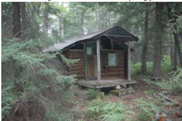
U.P. camp within State Forest

Newer migrants are often retirees or young profes-