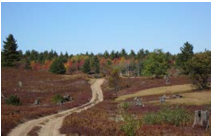
Lake Superior State Forest