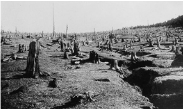
Extensive clear cut logging of climax forest hardwood (maple etc) and riparian conifer had a very detrimental effect on UP trout watersheds. Many of the cut over slashings subsequently burned further degrading those watersheds.

Check your newsletter's mailing label for your membership status. Phone and E-mail information is optional - UPEC does not share members' contact information with any other organizations. Thank You for your support!