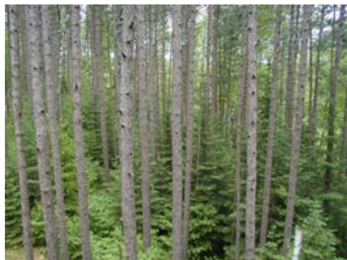
Fig 2 - Balsam fir under dense canopy of red pine by Eli Sagor

...the ecosystems of the U.P. are dynamic, changing constantly due to human management and natural processes (or lack thereof.)