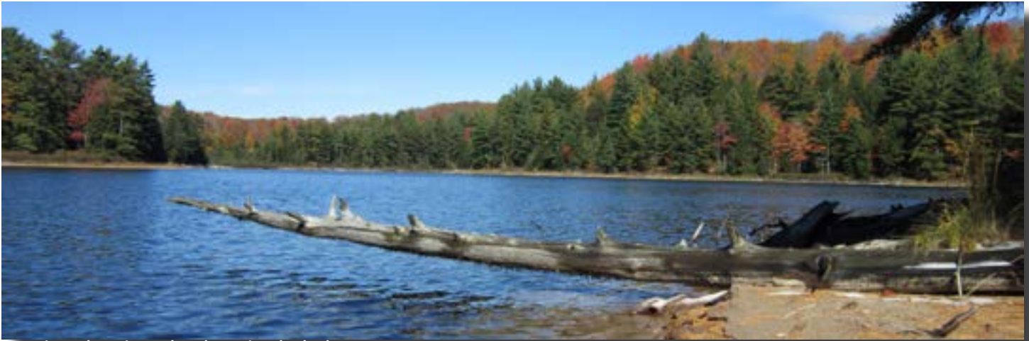
Legion Lake - Pictured Rocks National Lakeshore

Laughing Whitefish Falls Scenic Site – 360 - Managed by Michigan DNR