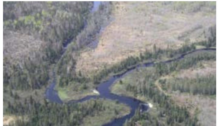
DNR air photo of confluence of the East and West Fence Rivers. Aggressive logging near these streams on State Land created at least 40 years more of ideal conditions for beaver habitat with ample aspen near the stream (author photo).

course. He indicated that significant decline in the brook trout fishery followed the extreme clear cutting of hardwoods (maple, etc) and lowland conifers adjacent to streams that occurred after the pine logging period was over. Generally, this follow up clear-cut logging ran from about 1900 till the 1940's. It is interesting to note that the Fence River Watershed's historical reputation as an outstanding trout fishery still has not recovered. It has remained aggressively logged industrial and State Forest land since it was initially logged over in the early 1900's. DNR trout population surveys on the East Fence and Fence Rivers reveal that although those rivers have excellent