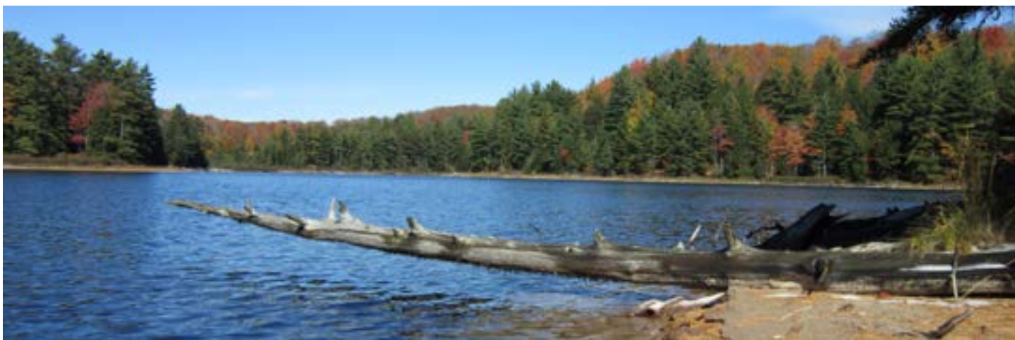
Legion Lake - Pictured Rocks National Lakeshore

Laughing Whitefish Falls Scenic Site – 360 - Managed by Michigan DNR