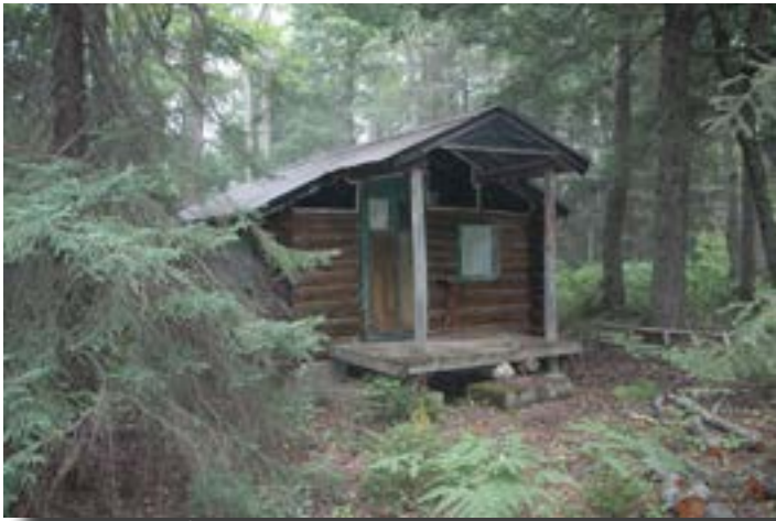
U.P. camp within State Forest

Newer migrants are often retirees or young profes-