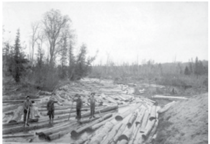
Log drive of pine logs down trout tributary streams were a widespread occurrence in the U.P.

The first human “development” to significantly affect watersheds and trout habitat was the logging activities entirely aimed at pine stands across the U.P. The initial logging activity in most U.P. watersheds occurred post civil war in the 1870's. Pine logs were the desired tree to provide building materials for the saw mills and it was the only wood that could be floated down the rivers to the mills. This was important since there was no developed transportation system present in the U.P. Pine logs were