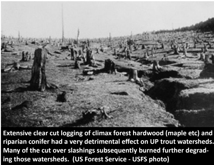
Extensive clear cut logging of climax forest hardwood (maple etc) and riparian conifer had a very detrimental effect on UP trout watersheds. Many of the cut over slashings subsequently burned further degrading those watersheds.

Check your newsletter's mailing label for your membership status. Phone and E-mail information is optional - UPEC does not share members' contact information with any other organizations. Thank You for your support!