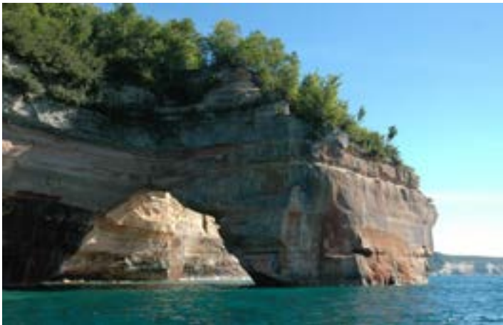
Little Portal - Pictured Rocks National Lakeshore

The abuses fostered by the lumber era motivated the development of the American forestry movement and motivated an intense debate over the relationships between water and deforestation that transformed American conservation. From the earliest years of American forest conservation, the purpose of forestry was not only to produce timber, but also to protect watersheds. When local citizens