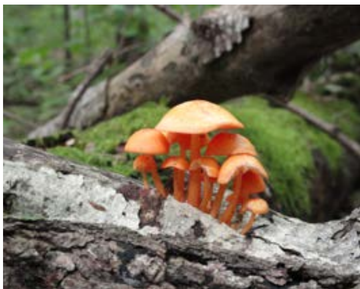
Rim Lake fungi - Hiawatha National Forest

Why are wild lands important? They are important to the existence of healthy ecosystems and interconnected webs of living species that exist in symbiotic relationships that we only dimly understand. They are crucial for the existence of a healthy planet. Wild lands also have a spiritual importance for humans because they define our place on the planet and allow us to occasionally escape ourselves, and our human-centered lives.