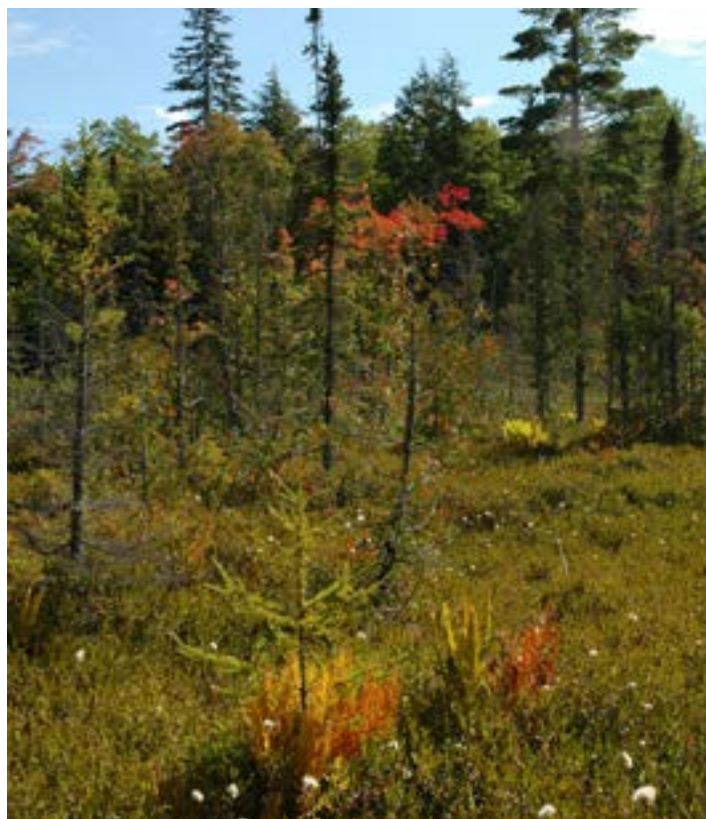
Spruce tamarack wetland

UPEC - P.O. Box 673, Houghton, MI 49931 906-201-1949 upec@upenvironment.org www.upenvironment.org and Facebook