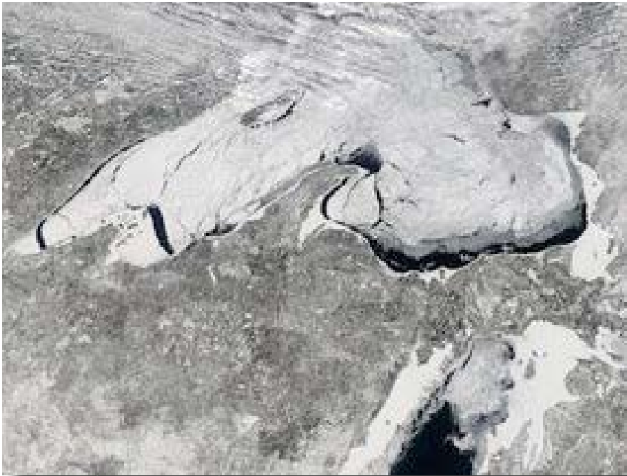
Winter in the Upper Peninsula

This winter issue of the newsletter is dedicated to the Big Picture, to zooming in and out in time, to see what has happened to the U.P. landscape and its myriad inhabitants, and also to imagine what may happen, or should happen in future decades. The good news is that 46.9 percent of the Upper Peninsula (in Bob Archibald's inventory) is to some degree protected, most of that public land that will not be converted to settlements or farms. This is a high percentage, envied by many activists in more populous regions of the country. In Edward O. Wilson's calculus, this large protected base should allow us to slow the extinction crisis and to preserve about 85 per-cent of our native flora and fauna.