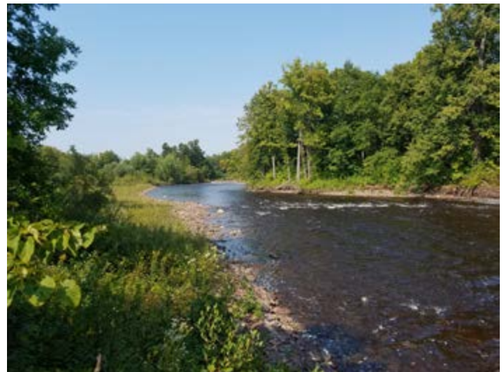
The Presque Isle River on its centuries-old journey to Lake Superior. September 3, 2017.

Clearly, the Porkies will be impacted by mining. According to Highland’s October press release (see: highlandcopper.com/news ), Highland expects to finish drilling in the Porkies this winter. Highland also states that “Every drill hole intersected copper-silver mineralization, as expected.” Highland’s plans include underground mining on land just west of the Park, hauling out some 6000 tons of material a day. Mining under park-owned land would be done from Highland’s land immediately adjacent to the Park, using an underground room-and-tunnel system. The company plans