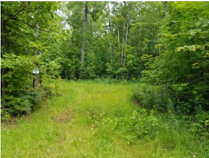
Most of the site has now been stabilized and seeded with ryegrass. September 3, 2017.

areas back to existing conditions”. The company continued drilling until early April, when photos by UPEC activists documenting the severe damage to the snowmobile trail and adjacent land along CR-519, reached media outlets and regulators. The Michigan DEQ shut the drilling down the next day.