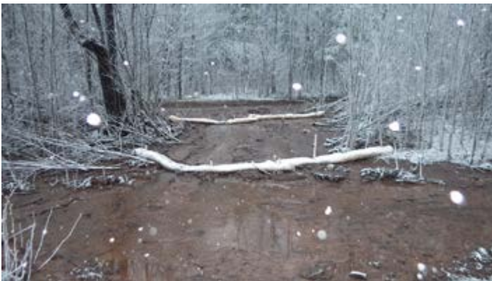
Three weeks after drilling ended, muddy water was still flowing from the site. April 26, 2017.

Relative quiet returned to the western end of the Porcupine Mountains Wilderness State Park ("The Porkies"), after exploratory drilling by Highland Copper Company Inc. (Highland) last spring. The noise of drilling rigs and other heavy equipment gave way to the raucous calls of ravens and the sound of the wind through the trees, broken occasionally by a passing car or a camper carrying visitors to the park.