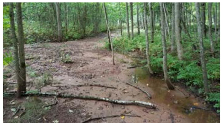
Silt and mud from the drill site was deposited at the bottom of the ravine, on the Presque Isle River floodplain. September 3, 2017.

Highland's contractor, Idea Drilling, had been drilling inside the Park until late February, when unseasonably warm weather and thawing ground caused them to suspend their operations, as required by an agreement with the Michigan DNR. This agreement limited the company