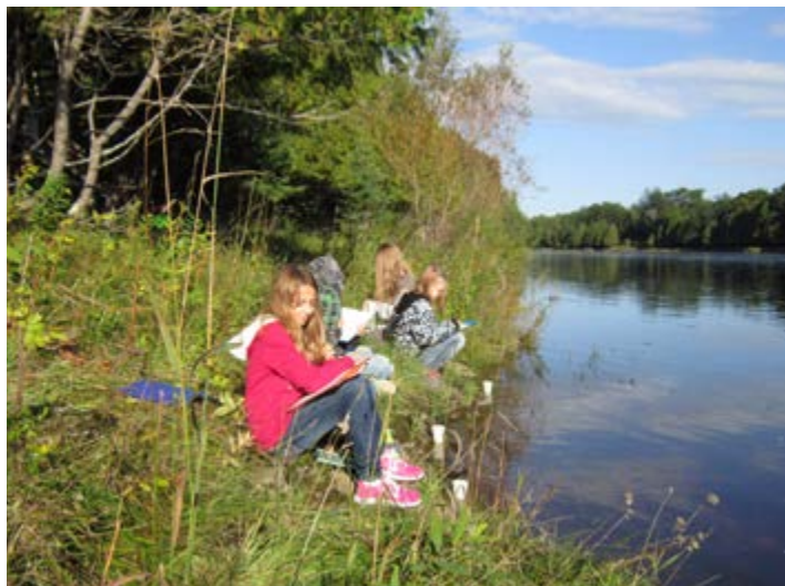
Students sketching on the Escanaba River

“wetland mitigation bank.” The wetland mitigation bank appears not to be self-sustaining, as it is hydrologically dependent upon industrial water discharges (or water diverted from the river).